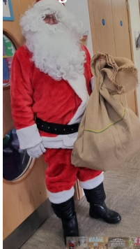
The Legend himself

Our school is part of Operation Encompass. This is a police and education early intervention safeguarding partnership which supports children and young people who experience Domestic Abuse.