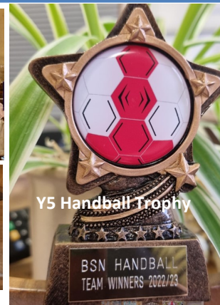
Y5 Handball Trophy